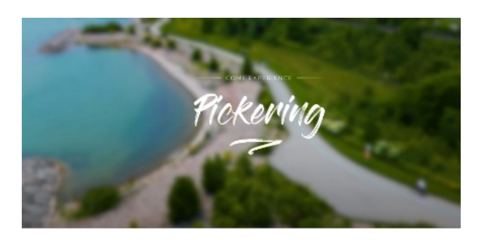
Click here or on the video above to see what makes Pickering so amazing!

Visit <u>LetsTalkPickering.ca/CTP</u> to complete the survey.