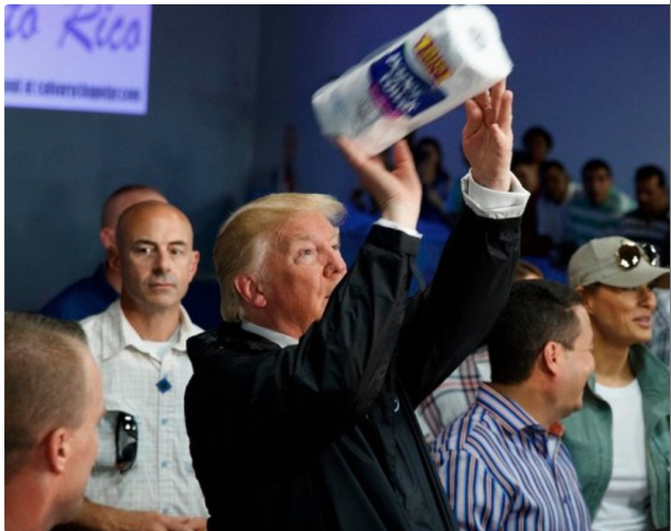
2. Trump tossing paper towels for victims of hurricane hurricanes in Puerto Rico