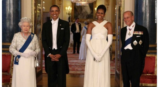
Obama couple with Queen Elizabeth-II.