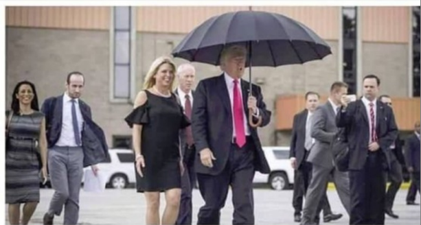
8. Trump protecting himself from getting wet in the rain.