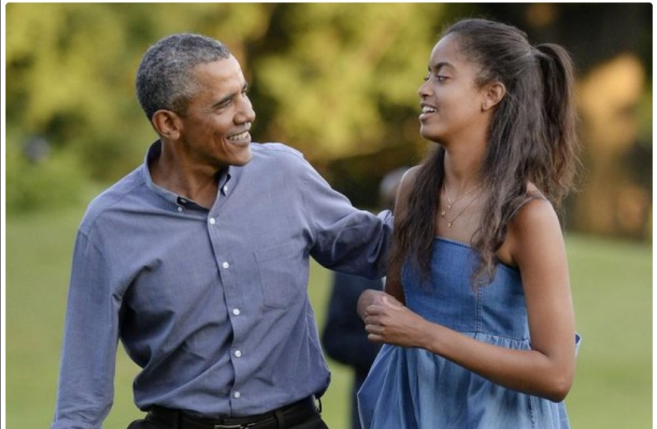
Obama with his daughter Malia.