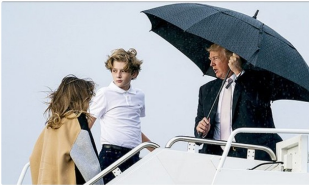
5. Trump was busy protecting his wig from the wind.