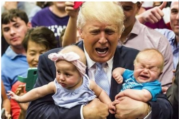
3. Trump and children.