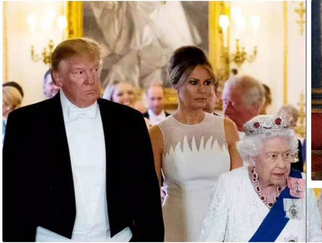
4. Trump couple with Queen Elizabeth-II.