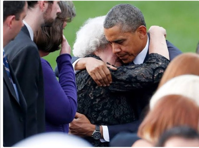
Obama hugging and comforting the parents of the victims of a public shootout.